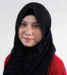
TIA INDAH GIS Database